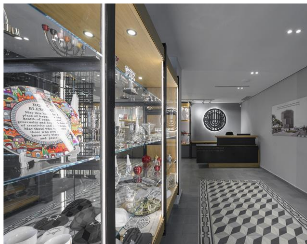
Monastirioton Synagogue by architect Ernst Loewy (1927 – restored 2016) and Jewish Museum (restored 2018) in Thessaloniki