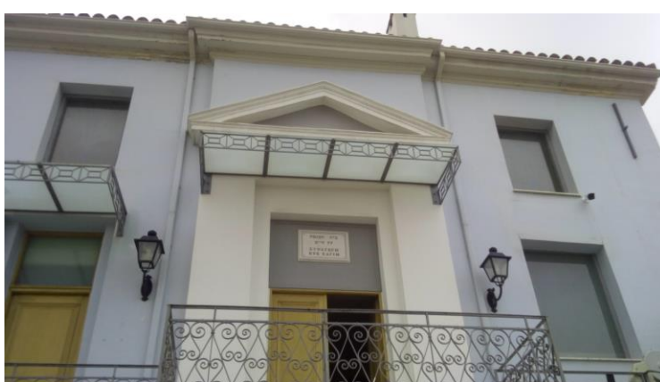
The historic synagogues Beth Shalom (1935) and Etz Hayim (1905) in Athens