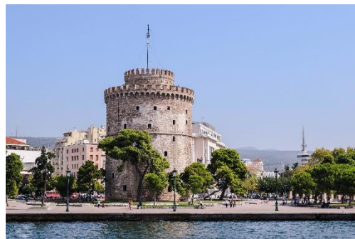
Thessaloniki: Aristotelous Square by Ernest Hebrard (after 1918) and the White Tower (1430)