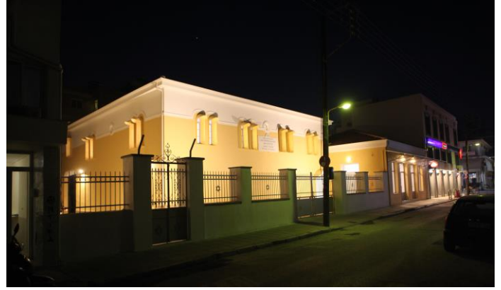
Interior and exterior of Yavanim Synagogue in Trikala (1931 – restored 2019)