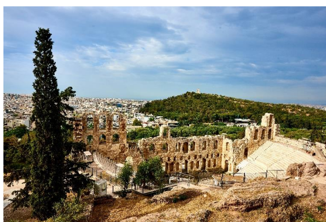
The Acropolis and Odeon of Herodes Atticus in Athens