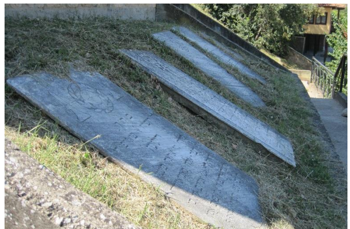
The synagogue of Veroia (prior to 1850) and the former Jewish cemetery in Veroia.