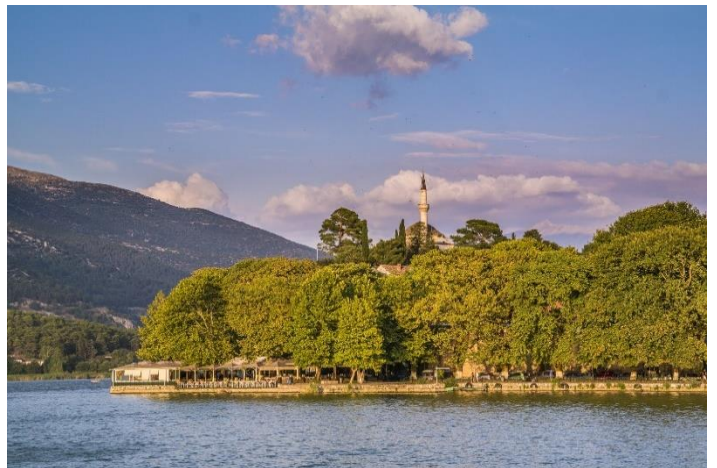
Ioannina: the synagogue Kahal Kadosh Yashan (1826) and views of the Lake