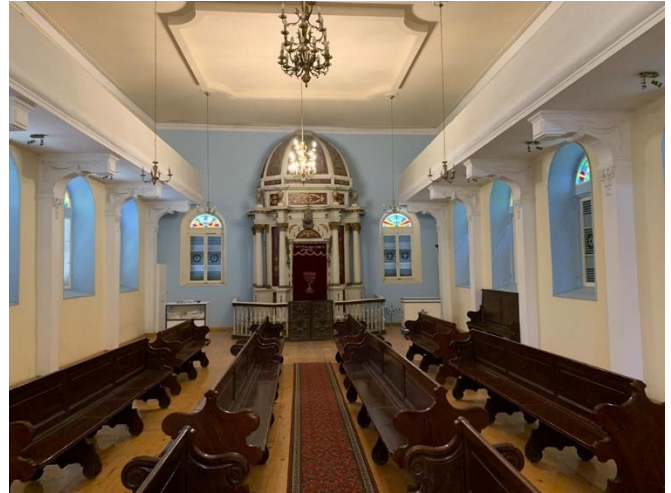
Corfu: The old city and synagogue Scuola Greca (c.17 th ).